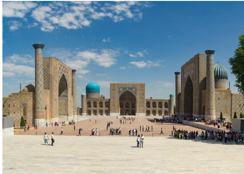
Registan Square with its majestic madrasahs